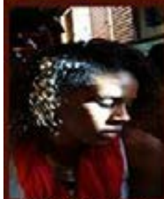
KI KI Charity